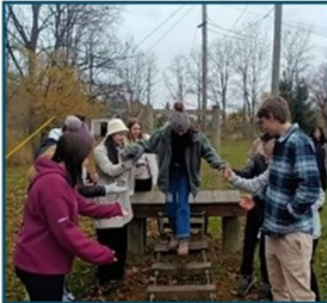
Photo on cover page is a winning entry in the 2022 CYCEAB Photo Contest and it was submitted by Mohawk College's CYC Advanced Therapeutic Programming class.

Confirm the name and attendance of your voting delegate at: admin@cycaccreditation.ca