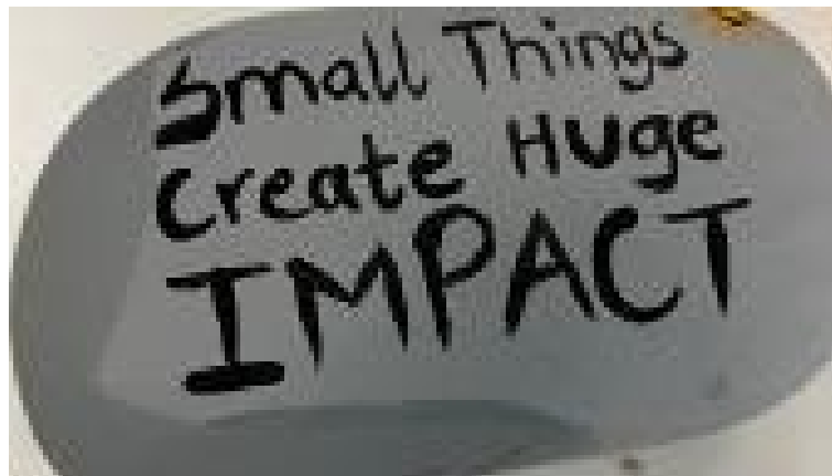
One of the winning submissions from Sheridan College in the CYCEAB Photo Contest 2022.

Impacts from the storms in Eastern Canada caused some challenges this year but the committee remains passionate about CYCEAB accreditation and continuous improvement.