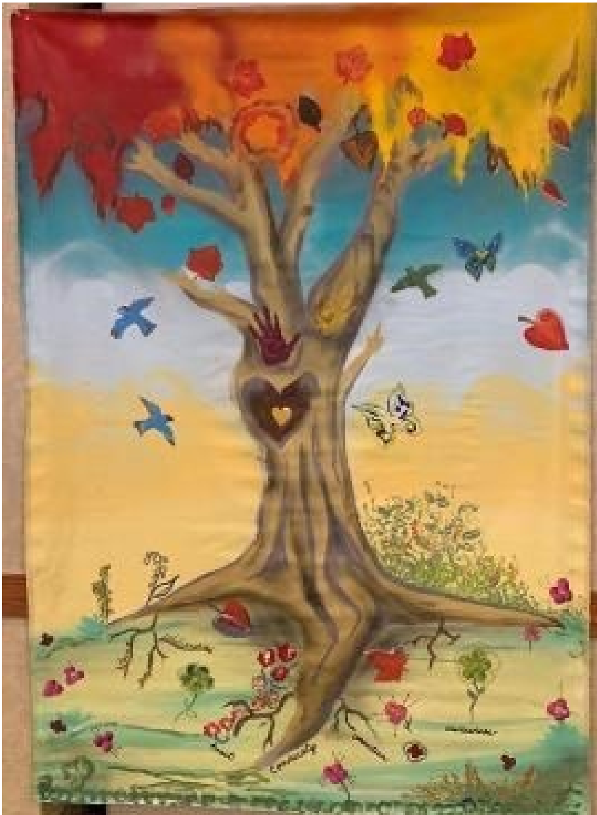
CYCEAB Education Day 2022 Art Project