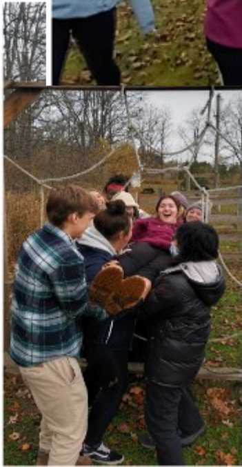
Mohawk College's CYC Advanced Therapeutic Programming Semester 3 class at Circle Square Ranch participating in Outdoor Adventure Programming.